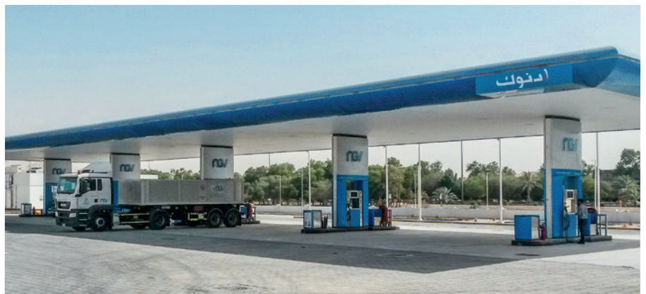
Enormous: the biggest natural gas refuelling station on the Arabian peninsula.

BAUER opened the “Mahawi” natural gas refuelling station one year ago and named it after the capital city of Abu Dhabi where it is located. The station’s fuelling capacity is a record-breaker on the Arab peninsula; it serves an incredible 50 trailer units plus 1,000 taxis daily, all powered by environmentally friendly CNG (Compressed Natural Gas). During the project planning and construction phases, BAUER was able to draw on a wealth of experience from its previous 35 refuelling-station projects in partnership with the state oil and gas company, ADNOC Distributions. Sand, high humidity and extreme temperatures all require extensive specialist expertise. At Mahawi Station, two Trio III systems are in operation. The “III” in the name indicates that these advanced systems are driven by three CFS IK26.14-90-C kit compres-