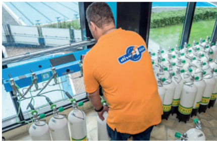
Dive4Life now uses BAUER B-NITROX 32

world to hold the quality mark of the leading technical testing and certification company, TÜV SÜD.