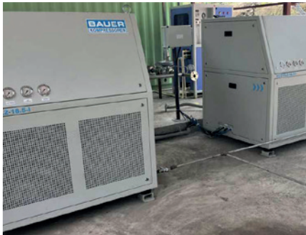
BAUER compressors at the biogas plant

actively investing its limited resources in environmental protection and is focusing more closely on biogas as a climate-neutral fuel.