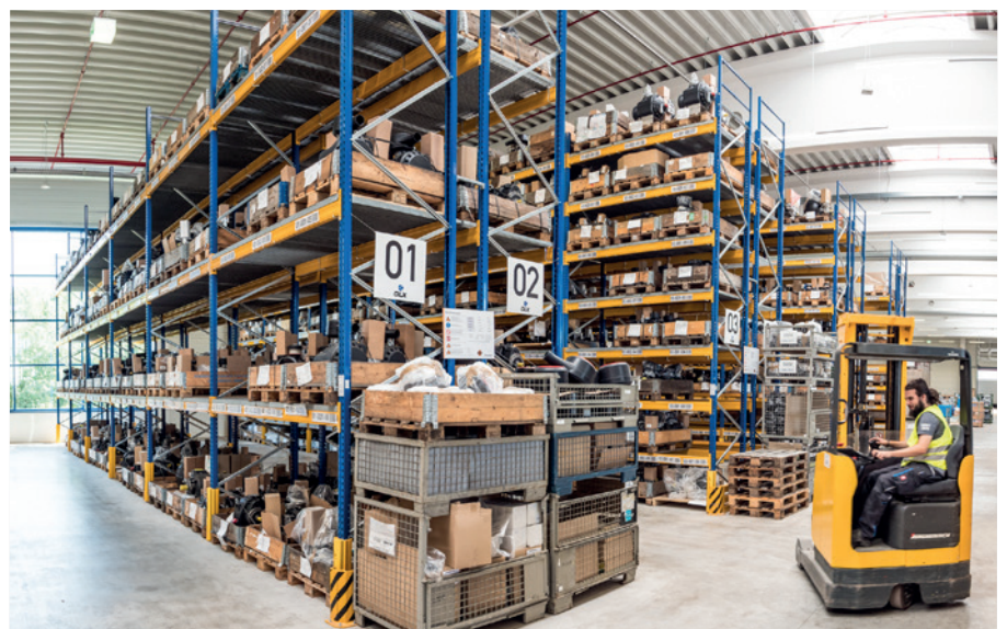
State-of-the-art storage logistics

BRENNER Verpackung has been a successful partner of BAUER KOMPRES-