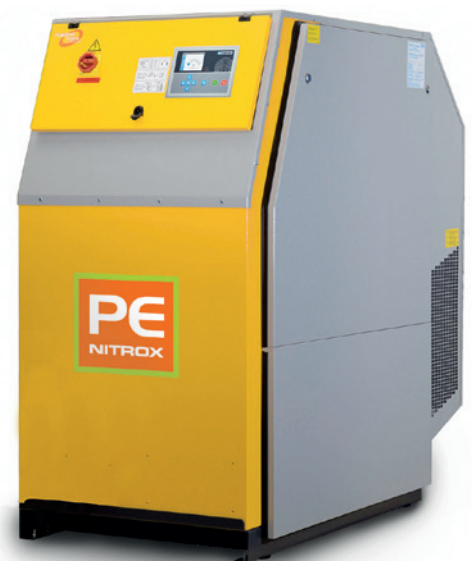
Especially attractive: the new PE Series as PE-NITROX model for membrane systems

A real star in the VERTICUS and PE-VE sector is the GIB15.41 booster system. With free air delivery of up to 830 l/min and maximum final pressure of 350 bar, it sets the standard for this sector. Enhancing cost-effectiveness in a compact design, compressors in the MINI-VERTICUS and VERTICUS series for helium and argon compression are now available in basic configurations with combined intake and condensate reservoirs.