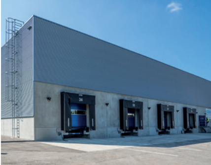
Truck loading bays at the ROTORCOMP LOGISTICS CENTER