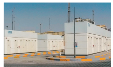
Concentrated power: the natural gas for the refuelling station is compressed and stored here.

The enormous volumes of highly compressed gas require generously proportioned buffer storage capacities. This is provided by two high-pressure storage banks combining 300 80-litre cylinders,