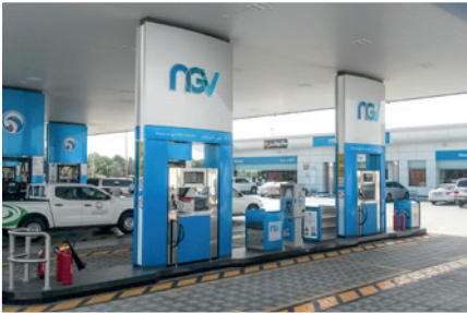
Fuel pumps for eco-friendly refuelling of CNG vehicles

which offer a total geometrical volume of 24m 3 . A volume that enables ten trailer units and four passenger vehicles – usually taxis travelling to and from the nearby airport – to refuel simultaneously. The trailer units are transported from the refuelling station to “daughter stations” that do not yet have their own gas supply, or are signposted “City Gas Supply” and positioned in cities to supply CNG to local production facilities and private households. After one year of full-scale operation, the results are outstanding: the systems have clocked up over 5,000 hours of smooth, fault-free operation with availability rates of over 98 per cent! The remaining two per cent were accounted for by regular maintenance works. ■