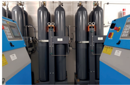
A redundant compressor system safeguards production