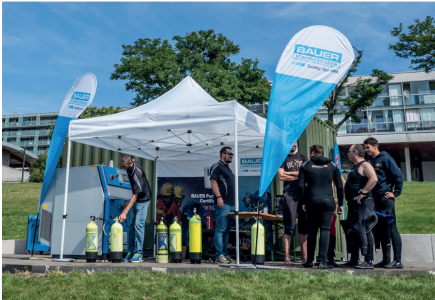
The BAUER filling station was in constant use as the divers replenished their air supplies.

part of the group. The ten-times free diving world record holder strapped on a diving cylinder to join in the underwater action and help the cleanup team. The event was a huge win for the environment – but casts a less favourable light on our society; by the end of the day, a huge skip had been completely filled with piles of rotting sunbeds, bikes and the like as well as endless drink cans and plastic waste. ■