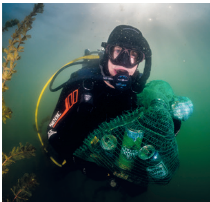
The divers cleared mountains of litter and debris out of the Danube.

part of the group. The ten-times free diving world record holder strapped on a diving cylinder to join in the underwater action and help the cleanup team. The event was a huge win for the environment – but casts a less favourable light on our society; by the end of the day, a huge skip had been completely filled with piles of rotting sunbeds, bikes and the like as well as endless drink cans and plastic waste. ■