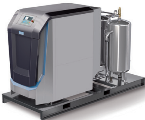
VERTICUS – the newest generation of BAUER compressors

As soon as customers enter the indoor diving centre, they can now see that the breathing equipment in use there is exclusively filled with top-quality breathing air certified to the DIN EN 12021:2014 standard. ■