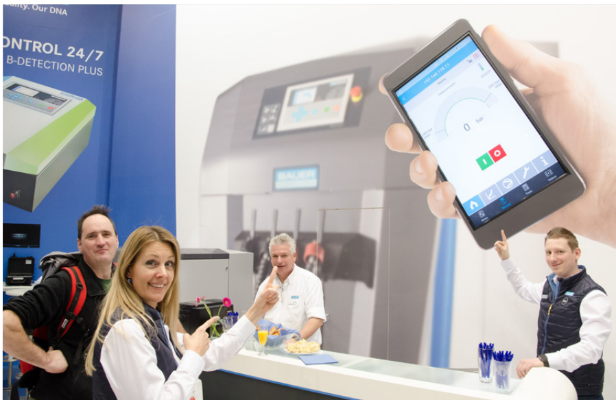
The new B-APP live in action. The app allows the status of the MINI-VERTICUS to be monitored in real time on the user's smartphone display

temperature. Combined with B-DETECTION PLUS, a further new feature for on-line gas measurement, the app ensures seamless monitoring of compliance with defined air and gas toxin limit values.