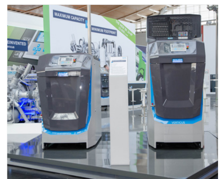
The new MINI-VERTICUS and VERTICUS series, prominently showcased at HANNOVER MESSE

The smartphone display can be used to remotely monitor and control the main system parameters, including pressure, filter cartridge life and oil