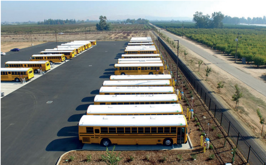
Reedley District's CNG vehicle fleet is constantly growing, and already has 33 vehicles