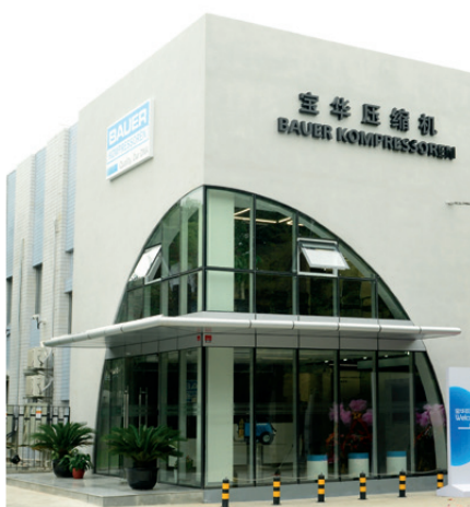
The new company headquarters in SMUDC Minhang business complex, Shanghai

The original premises had an area of 1,200 square metres and were designed purely as a sales office. However, customers had high expectations of BAUER KOMPRESSOREN as a premium manufacturer, and the company was faced with the need to expand its workforce in the areas of design, quality